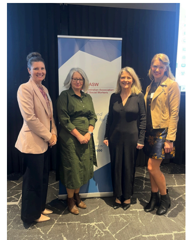
AASW Public Event , 24th Aug 2024

We place emphasis open communication and feedback with regular updates and opportunities for stakeholders to provide input and insights and to voice concerns. We want our stakeholders to help shape our initiatives. Effective stakeholder engagement leads to clearer expectations and a more widely accepted outcome.